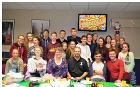
Teen Christmas Party

Christmas celebrations in Narva, Estonia vary. It all started a 1,000 or so years ago. Pope Gregory XIII introduced an updated calendar (Gregorian calendar) because the Julian Calendar had 365.25 days a year and needed adjustments often. The Gregorian calendar has 365.2425 days a year only needing a leap year every 4 years. The Catholic countries adopted the new Gregorian calendar celebrating Christmas on Dec. 25th. The eastern countries including the Orthodox churches kept the Julian calendar which had Christmas falling on January 7th.